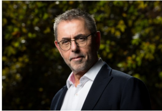
Dr Norman Swan Keynote Speaker