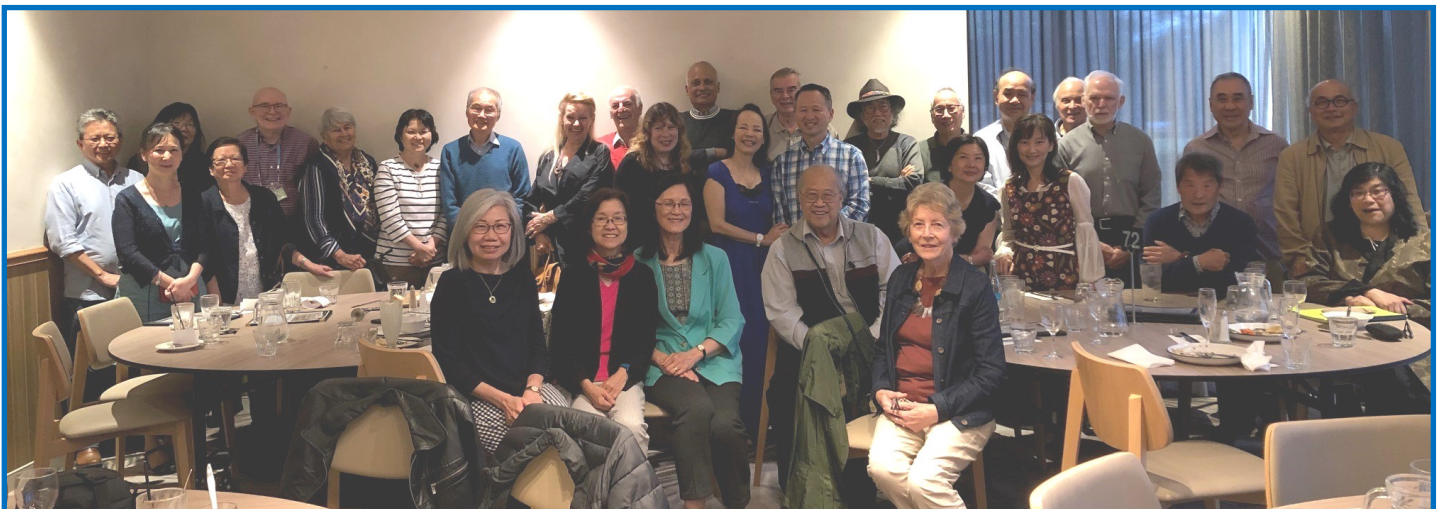
Waverley and Wheelers Hill Guitar Groups