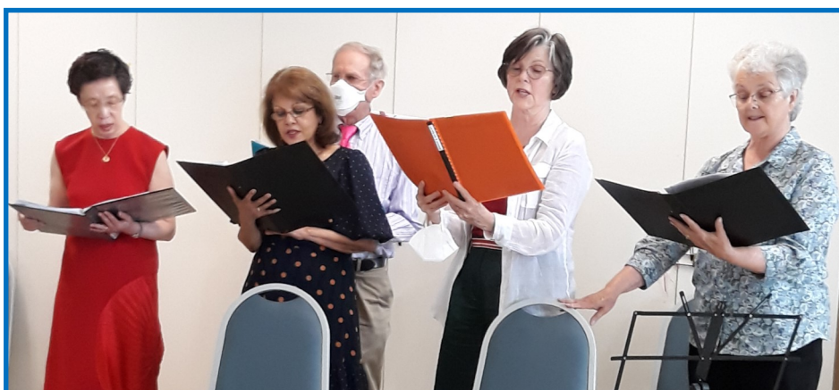
Some of our choir members at our enjoyable U3A Christmas Breakup

A laugh for you sent in by Geoff Fitzpatrick