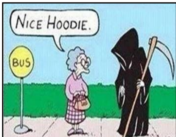
Flirting with death.

Beer is now cheaper than gas. Drink, don't drive.